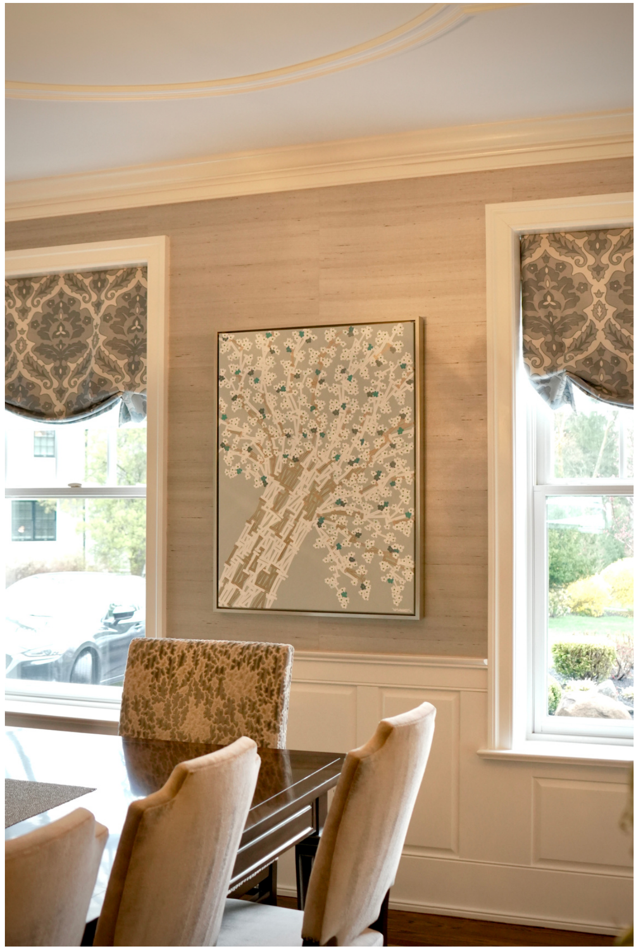
Family Birth Dates Included