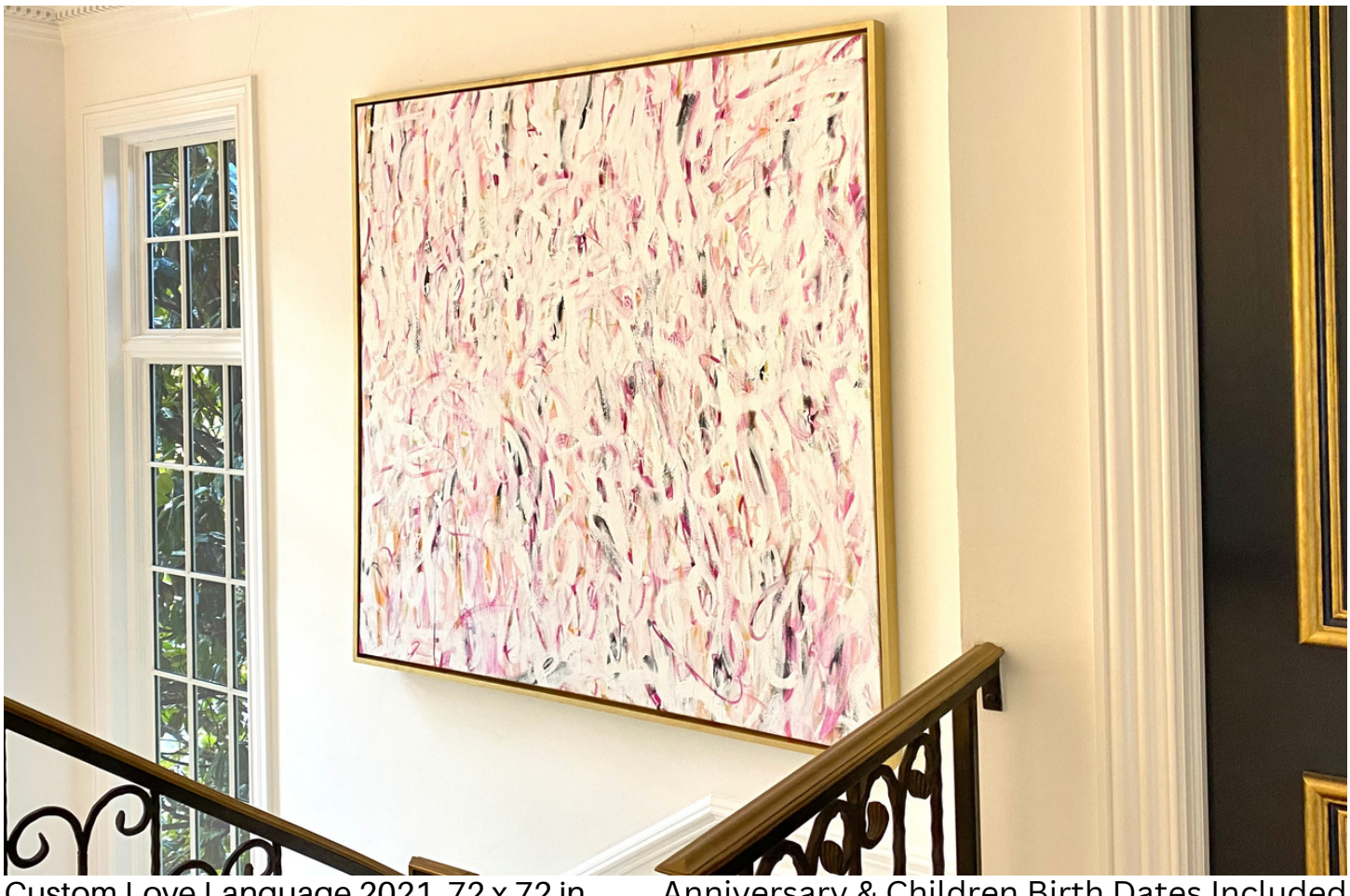
Children Birth Dates Included