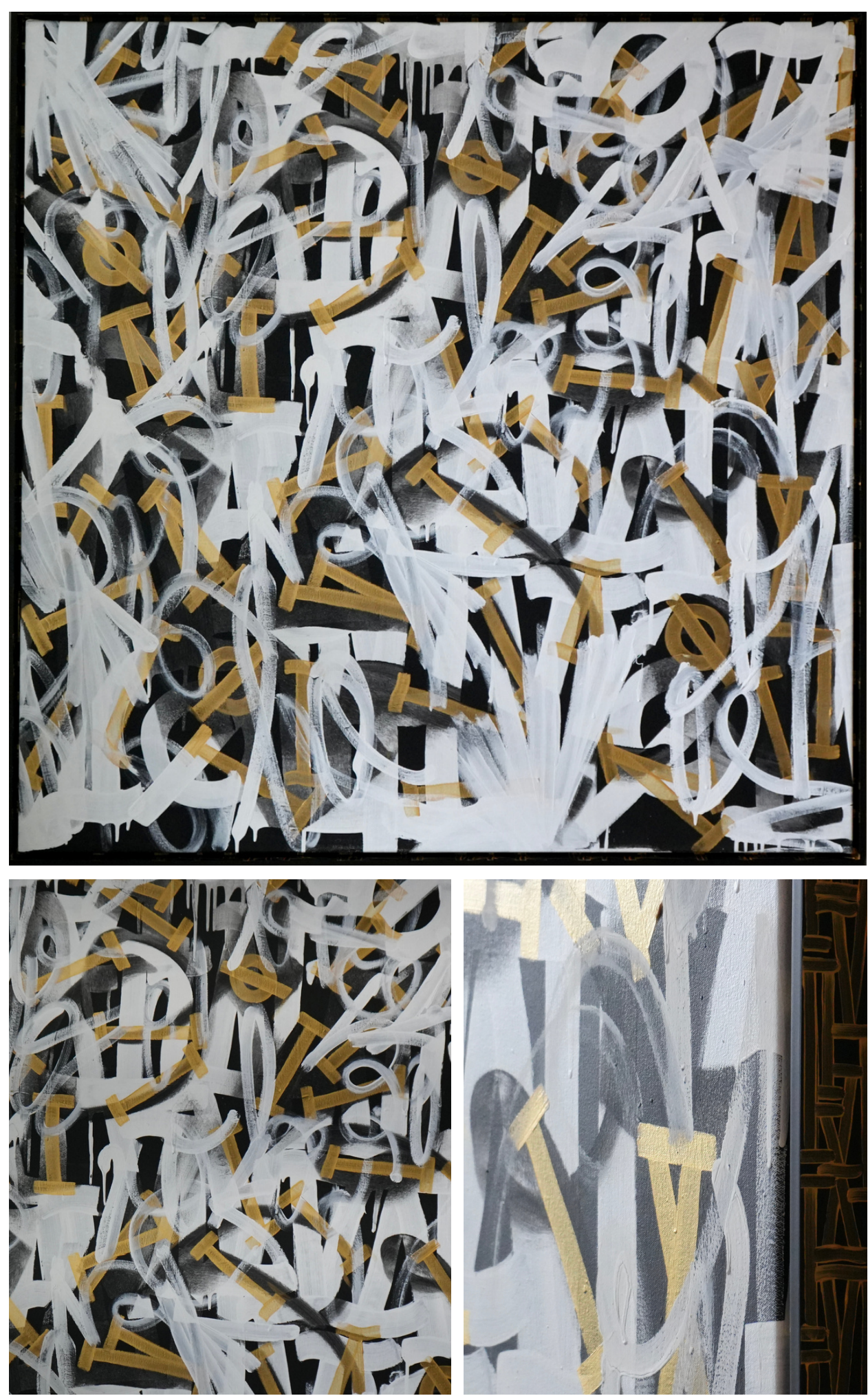
Love Language 2023, 48 x 48 in