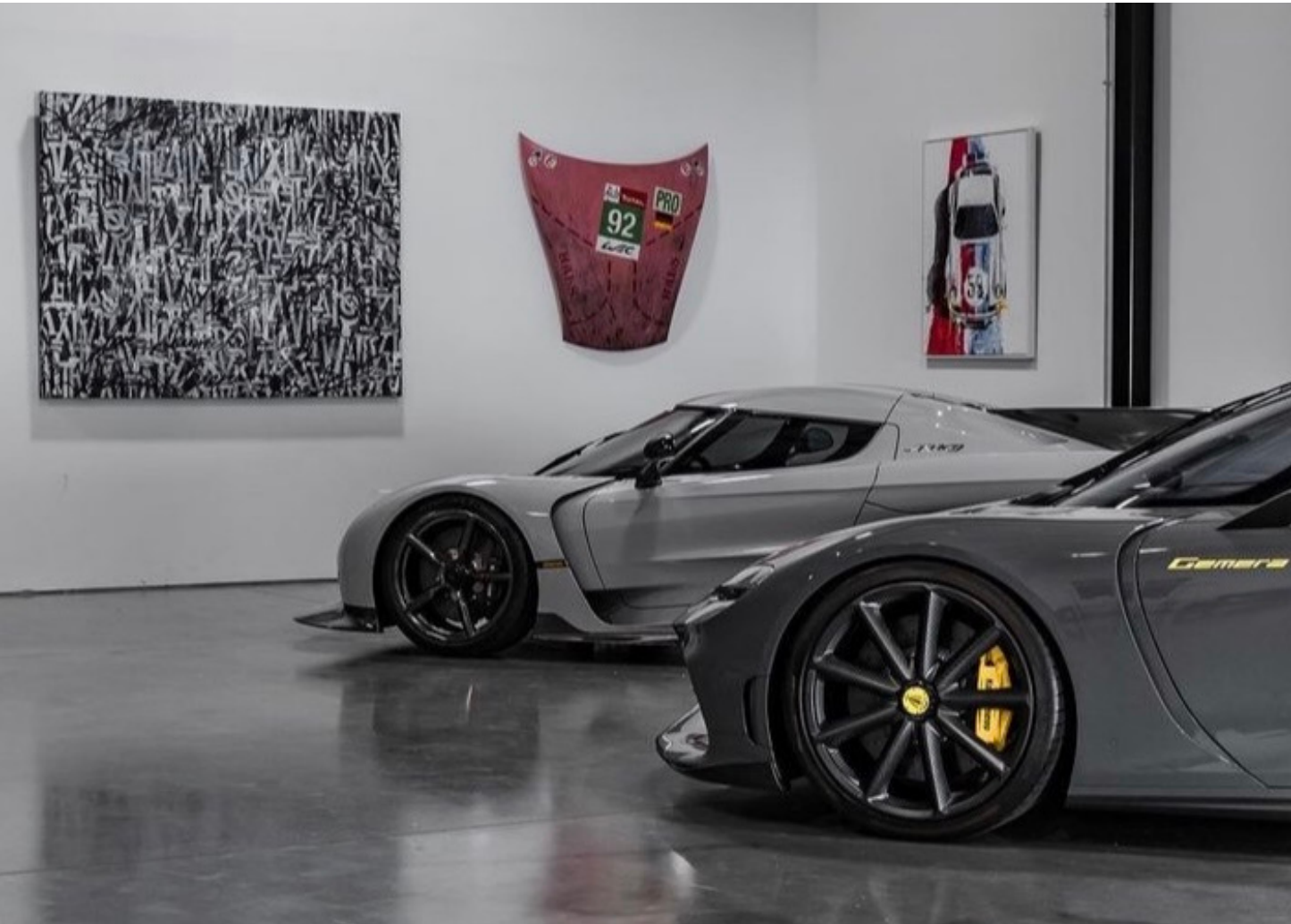
Love Language 2021, 72 x 84 in