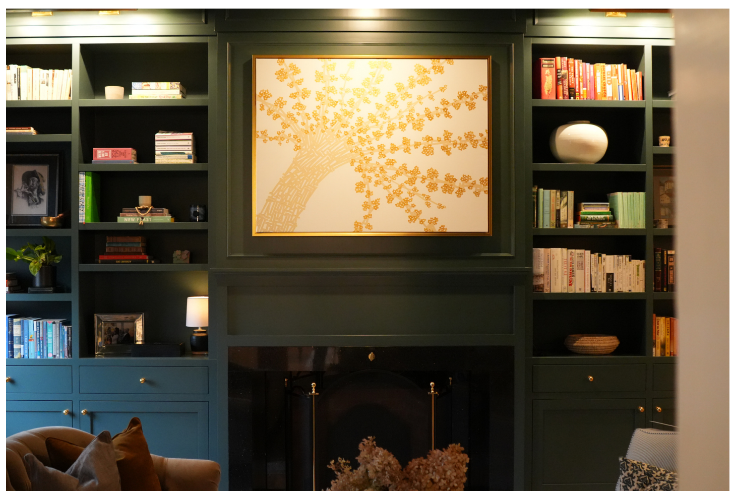
Custom Growth 2024, 36 x 48 in