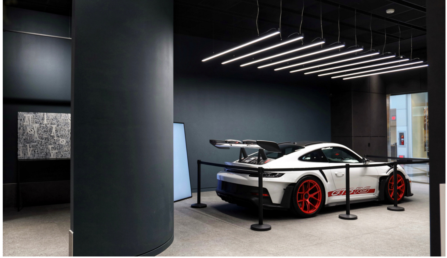
Love Language 2023, 36 x 48 in

In Partnership With Porsche North America